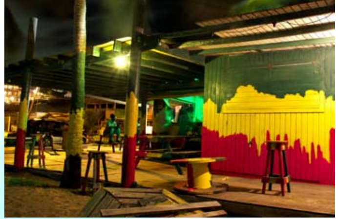
Beach Bar, Frigate Bay Strip