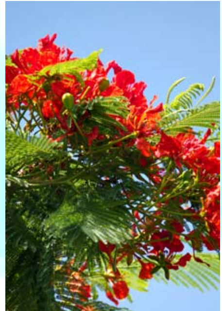
Pionciana - National Flower

* Government fees are subject to change.