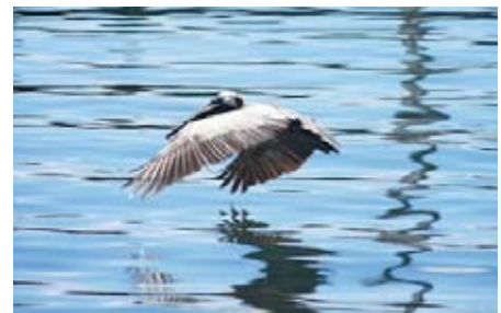
Brown Pelican - National Bird