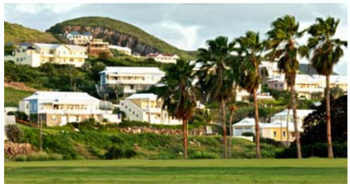
Sunrise Hills Villas - A picturesque hillside