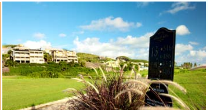
View from Royal St. Kitts Golf Course, Frigate Bay