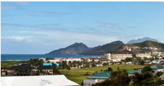
View of Frigate Bay from Sunrise Hills Villas