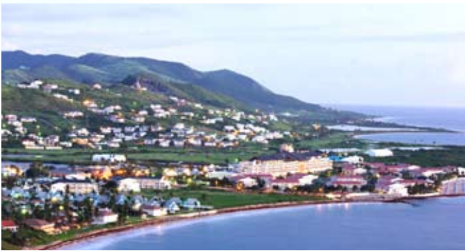
View of the area from Timothy Hill, Frigate Bay