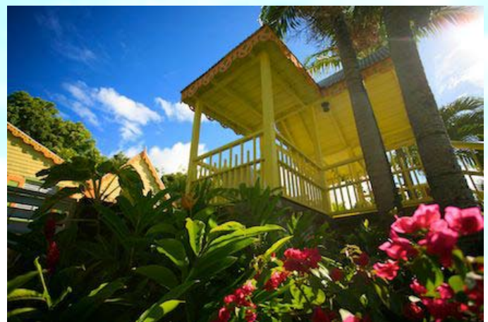
Caribelle Batik, Old Road