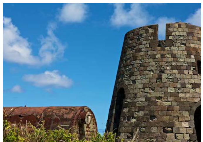
Old Sugar Mill, Dieppe Bay