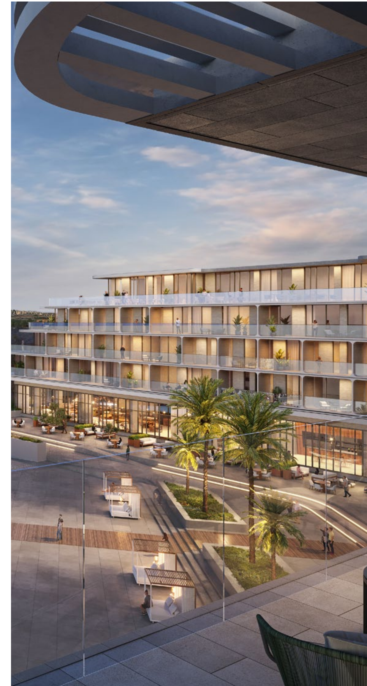
TRUMP INTERNATIONAL HOTEL, OMAN