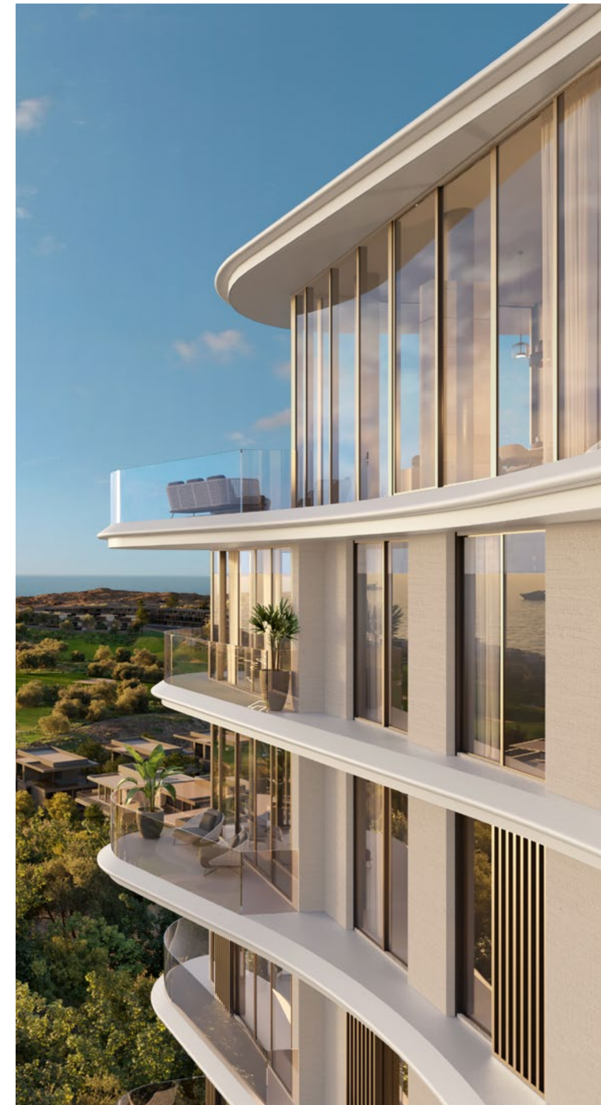
THE GREAT ESCAPE RESIDENCES