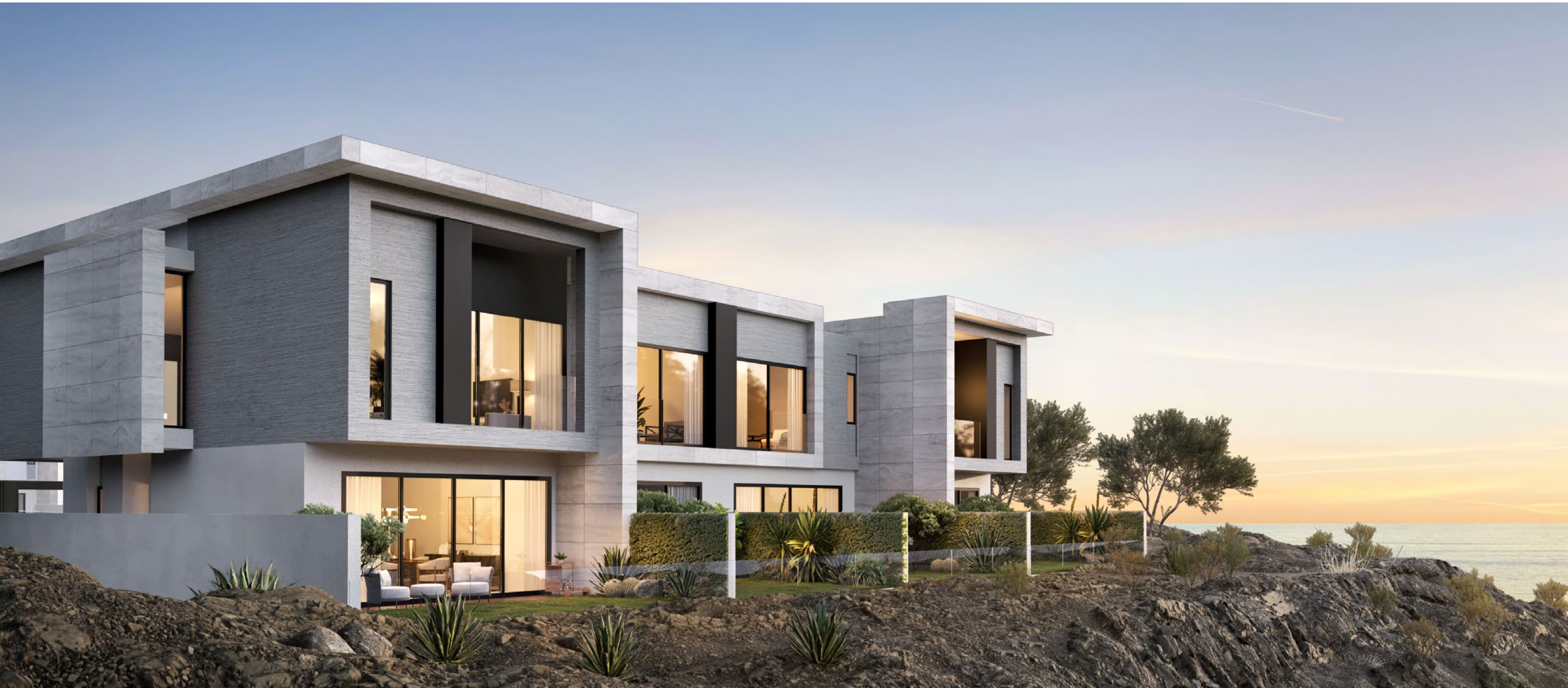
TRUMP CLIFF VILLAS