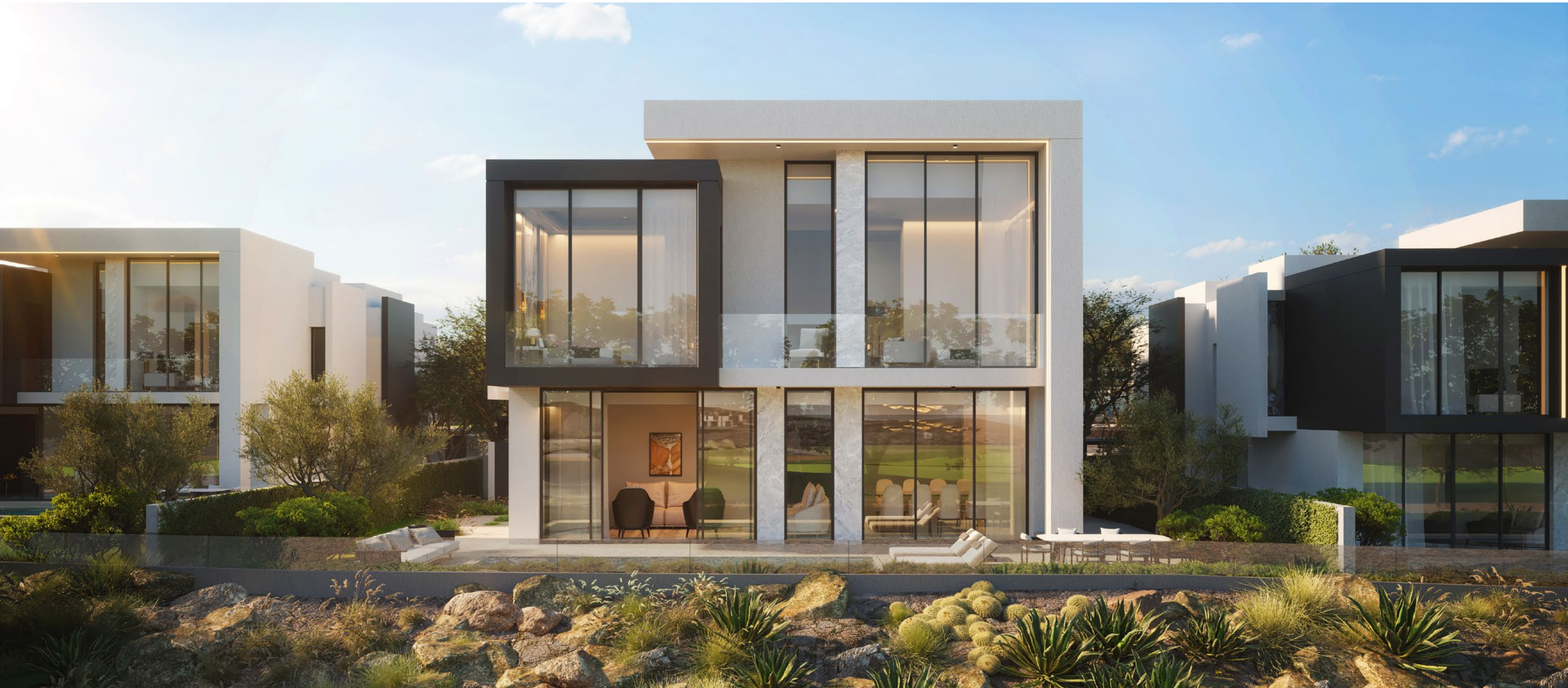
TRUMP GOLF VILLAS