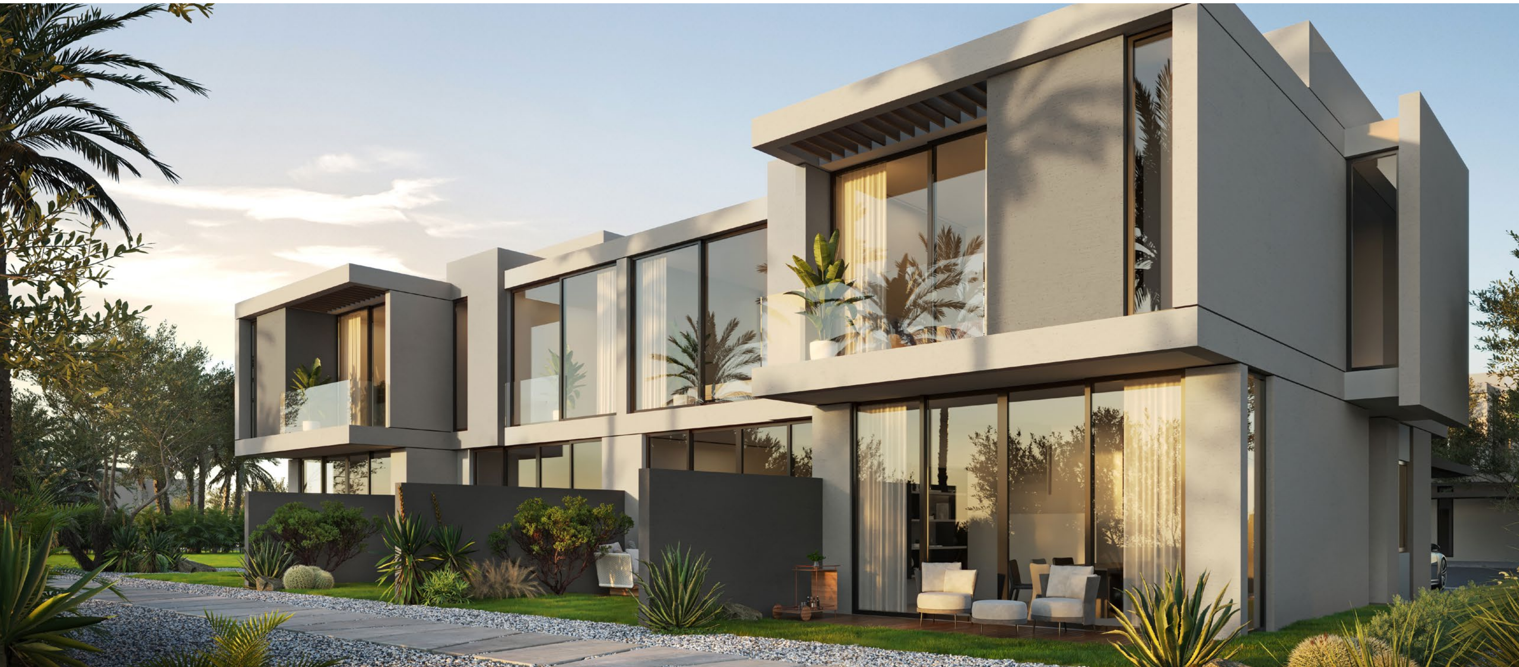
SUNRISE HAVEN VILLAS