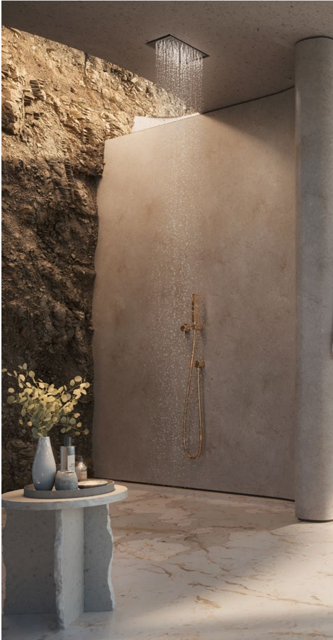
TRUMP HOTELS HANGING SUITES “The Most Beautiful Hotel on Earth”